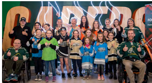
Members of the Cape Breton Blizzards girl hockey teams and the CB Sledgehammers celebrating after the ground breaking.

In the spring of 2022, Cape Breton University partnered with the Cape Breton Blizzard Female Hockey Association and launched a winning national campaign to have Sydney named Kraft Hockeyville 2022. The $250,000 prize was used to purchase a new energy-efficient ice plant, and an electric Zamboni will be purchased in the near future. In March 2023, the facility also received close to $12 million from the Province of Nova Scotia, $8.15 million for the arena to become the Home of Female Hockey and $3.7 million to expand the Nancy Dingwall Health and Counselling Centre, which provides access to physical and mental healthcare services for a growing and diverse student body.