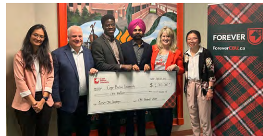
Members of the 2022 and 2023 CBUSU Executives celebrating their $1 million gift to the Forever CBU campaign.