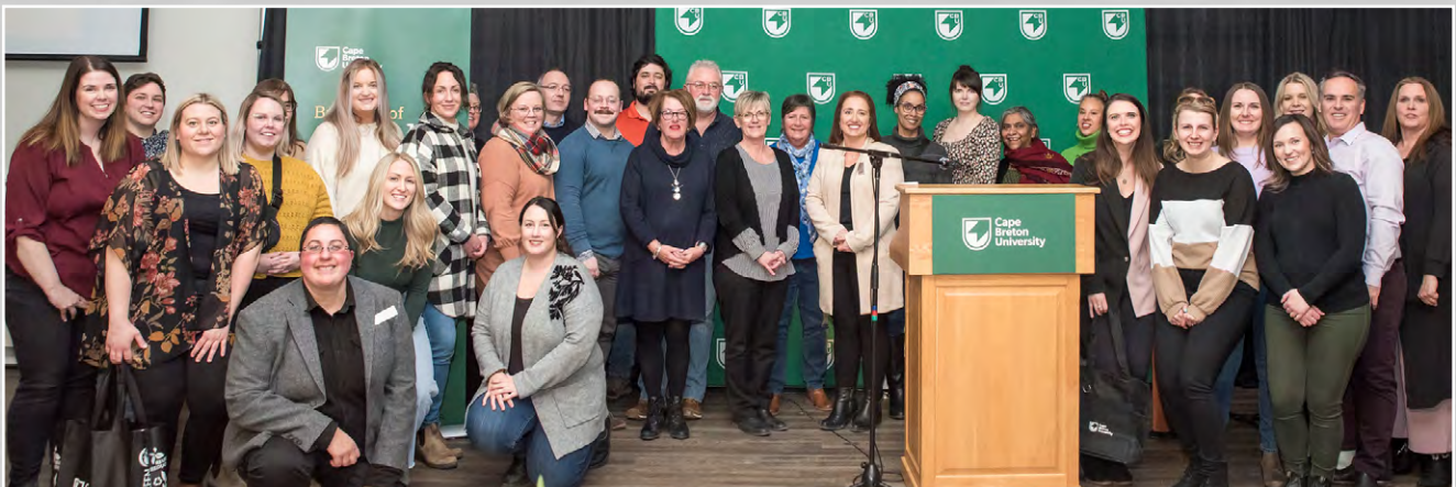
Attendees at the Bachelor of Social Work launch event.

To learn more about the program, visit CBU.ca/socialwork .