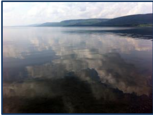
Bras D'or Lakes, Unama'ki