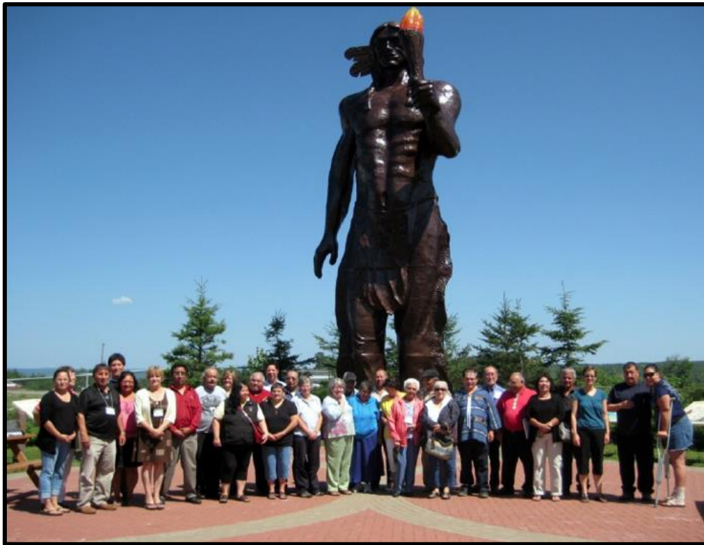
Figure D – The Atlantic Policy Congress of First Nations Chiefs Elders Project: Honouring Traditional Knowledge

serve as a record of spoken Wolastoq for future generations. (For more information about this project, contact the Mi'kmaq/Wolastoqey Centre at UNB.) The Unama'ki Institute of Natural Resources has done much Elder-led research, and has protocols and promising practices for working with Elders from all five Unama'ki communities. Consultation concerning Mi'kmaq Knowledge is required by outside agencies. Work with Elders has resulted in publications such as Malikewej: Understanding the Mi'kmaq Way , Kataq-Mi'kmaq Ecological Knowledge: Bras d'Or Lakes Eels and Tiam: This is Our Story . The Mi'kmaqey Debert Cultural Center of the Confederation of Mainland Mi'kmaq is led by an Elders Council. An example of community-based participatory research using the Mi'kmaq principle of Etuaptmunk or two-eyed seeing and working with Elders is the Pictou Landing Native Women's Association Boat Harbour Project , which seeks to answer – "Is Boat Harbour making us sick?" The Unama'ki College of CBU administers the Mi'kmaq Ethics Watch , which promotes community guidelines for working with Mi'kmaq peoples.