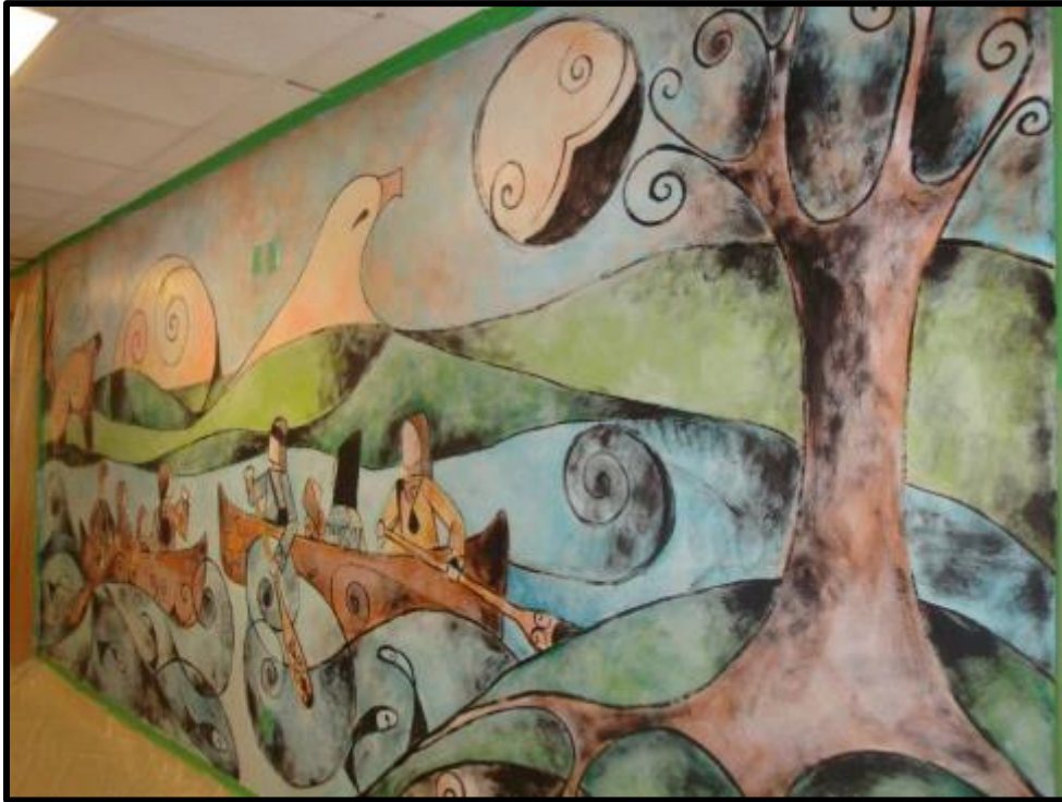
Figure C – The Water Spirit - Samaqani Cocahq-Natalie Sappier